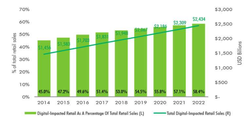
Fig 2 – Digital Sales

At the same time, other categories will see lower e-commerce in cities than in suburbs, as urban consumers have easy access to physical store networks.